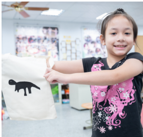
▲ 帶著深度多元的藝文體驗，走進偏鄉學校、社區，讓孩子開啟視野，發現充滿潛力的自己 Within in-depth diverse arts and cultural workshops entered rural schools and communities to broaden the childrens' horizons and discover their potential.